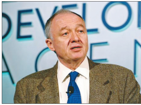
Mayor of London Ken Livingstone

Mayor of London, Ken Livingstone, will launch the festival on July 15. The theme of the event is 'India and London — Partners in Globalisation', reported Asians in