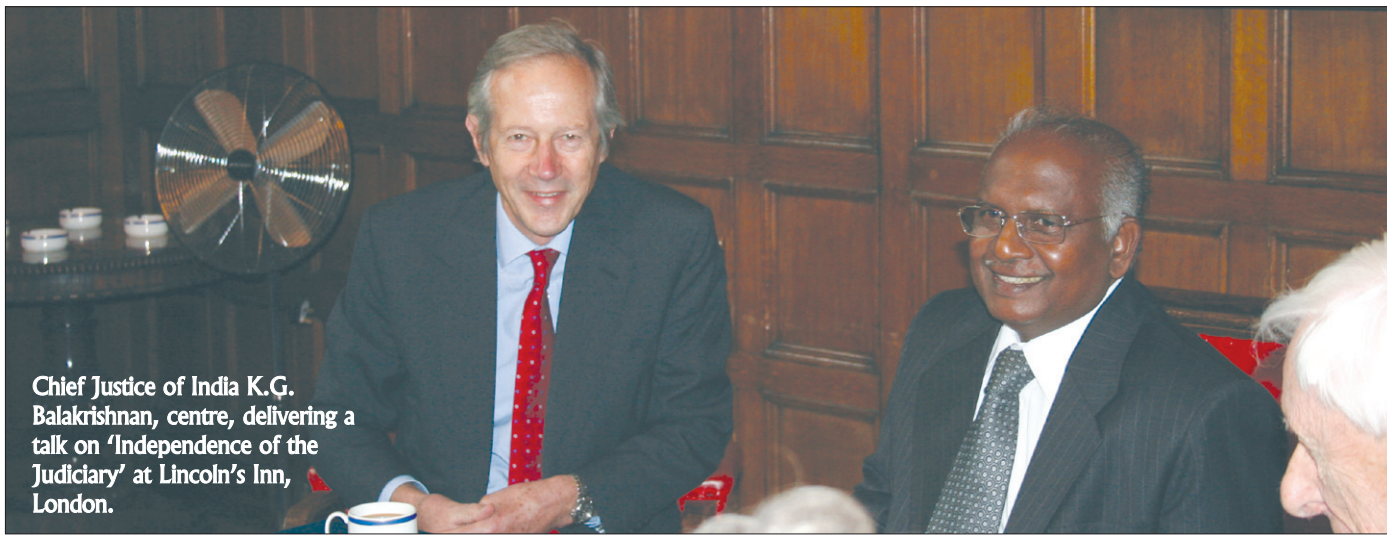
Chief Justice of India K.G. Balakrishnan, centre, delivering a talk on 'Independence of the Judiciary' at Lincoln's Inn, London.

India definitely seems to be the flavour of the season in Britain. Earlier in June, the International Indian Film Academy (IIFA) held a four-day gala event in Yorkshire, complete with Bollywood stars and their glitzy performances.